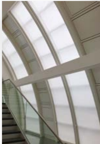
GJ - SZ SERIES Page 6