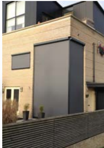
GJ - ZP SERIES Page 5