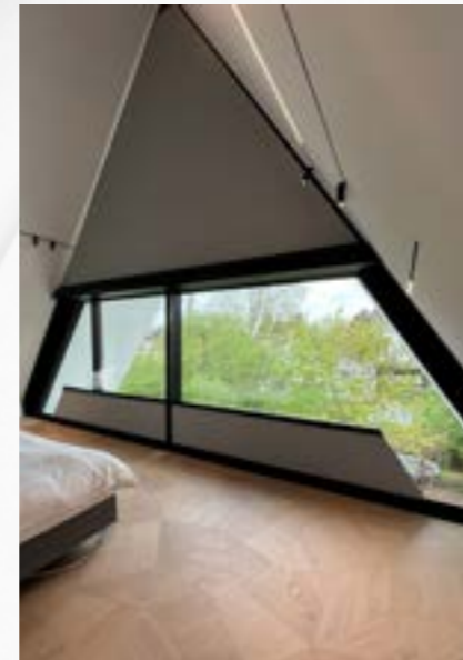
GJ - MW SERIES Page 7