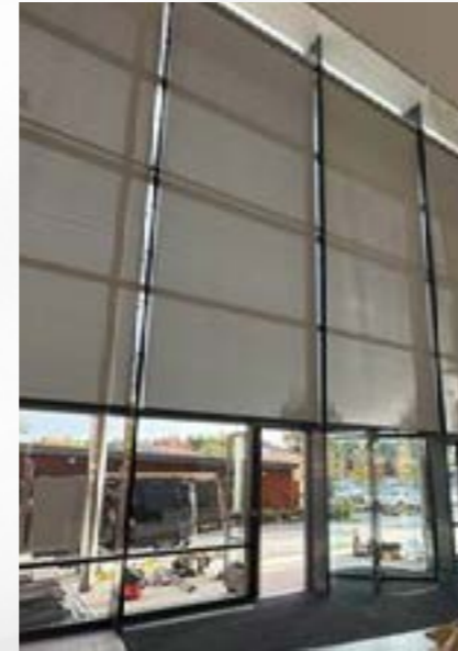
GJ - RB SERIES Page 4